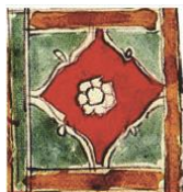
Sephardic Studies Research Institute

החברה לחקר יהדות ספרד ופזורתה | סוסיידלד די איסטודיאוס סיפ'ארראדים Sociedad de estudios sefaradis | Society for Sephardic Studies