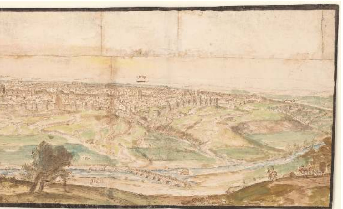
Wyngaerde, Panoramic view of Madrid, ÖNB, Cod. Min, 41 (1563)

In the Madrid 2022 International Spring School in Jewish Studies, scholars and students from various places of Jewish belonging will explore the diverse historical questions of exile, belonging and home. We aim at learning about new realms of the Jewish existence and their mutual relationship.