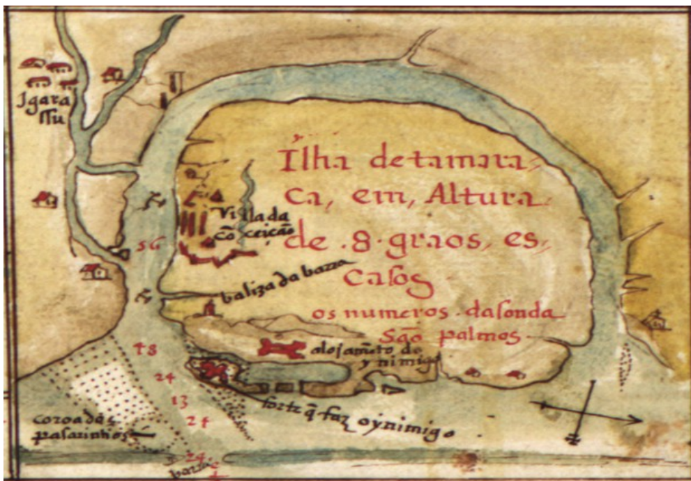
Portuguese map of the island of Itamaracá – João Teixeira Albernaz 1640