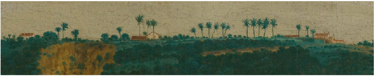
Detail of Vila Velha in 1637 – Frans Post.